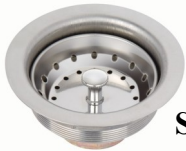
Sink Strainer Optional